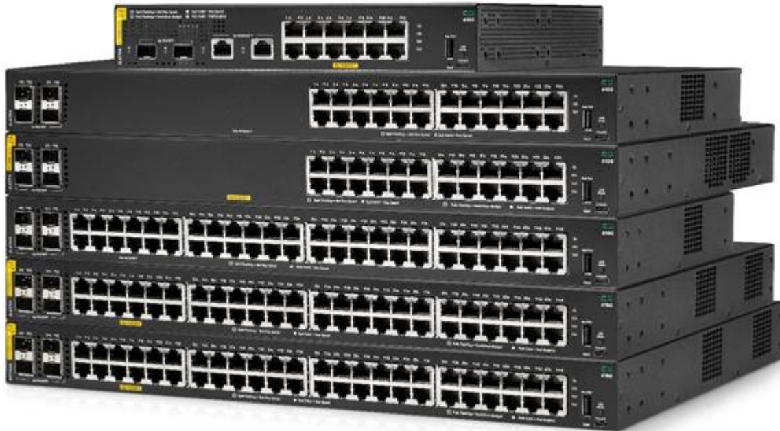
HPE Aruba Networking CX 6100 Switch Series

The HPE Aruba Networking CX 6100 Switch series supports management choices that include Web GUI, CLI, cloud-based and on-premises HPE Aruba Networking Central, so you can choose the best fit for your needs today with flexibility to change without replacing hardware. With enhanced access security, traffic prioritization, and IPv6 support, the HPE Aruba Networking CX 6100 Switch series also simplifies ownership and brings peace of mind with switch software embedded with no subscription required to enable and a Limited Lifetime Warranty.